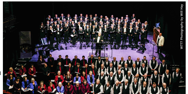
Three Choirs at Storyhouse